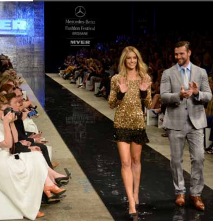
Jennifer Hawkins walks the MBFF Brisbane runway