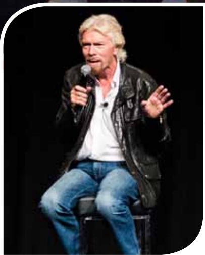
Sir Richard Branson

The Royal International Convention Centre (Royal ICC) played host to iconic entrepreneur Sir Richard Branson in September.