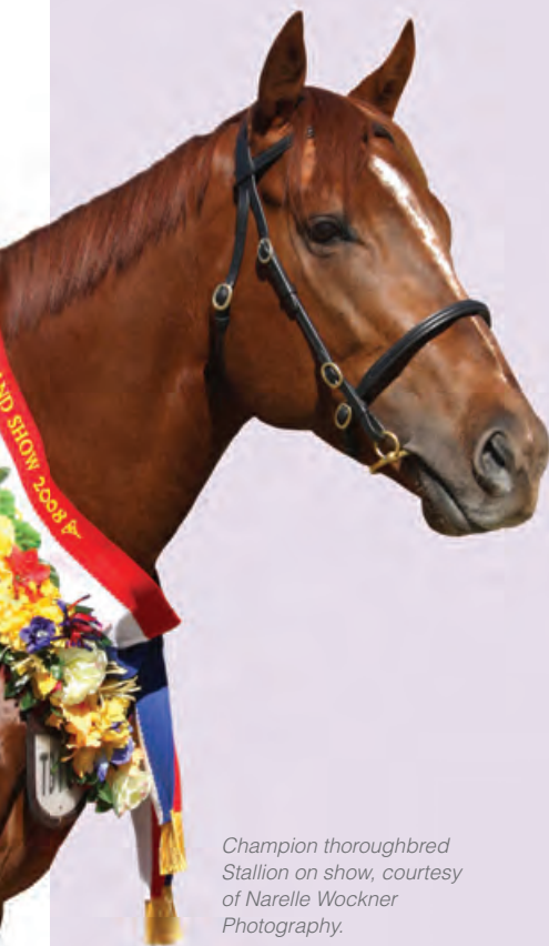
Champion thoroughbred Stallion on show, courtesy of Narelle Wockner Photography.

Widely regarded as the premier thoroughbred judging competition in Australia, EkkA's Thoroughbred Day offers $66,000 worth of prizes across eight categories including Champion Thoroughbred Gelding, Champion Thoroughbred Mare, Best Two Year Old Thoroughbred Exhibit, Champion Thoroughbred Stallion and the hotly contested Best Dressed Strapper competition for men and women.