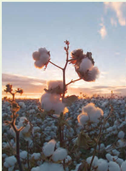
(Top) Cotton crops at sunset and (bottom right) cotton picker at dusk, courtesy of Queensland Cotton.

Australia's agrisector has been dressing (and under-dressing) people all over the world for decades through the production of wool and cotton.