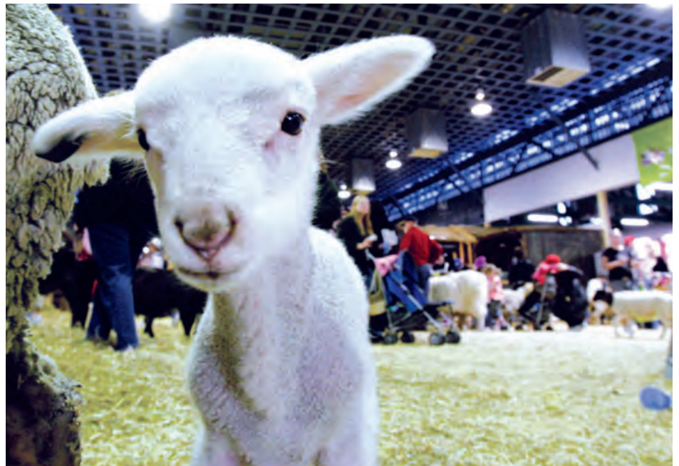
Its fleece as white as snow... little lamb photographed in the RACQ Insurance Animal Nursery during Ekka 2008.

"We want them to be as familiar and as comfortable as possible with the environment of the Show facility," said Mr Kemp. "The lambs will be assessed and transported well prior to the Show to ensure they are settled and all lambs born at the Show will stay on site until after Ekka closes."