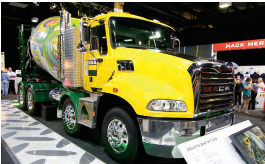
The heavy vehicle industry is not letting the global financial crisis stand in its way, courtesy of Madden Advertising 2009.