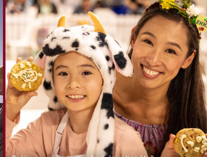
ducation Hall Grain activation