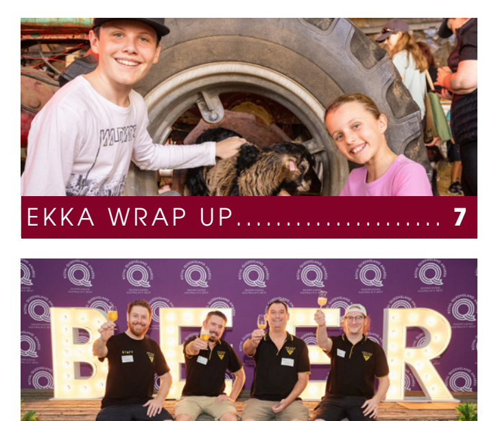
ROYAL QUEENSLAND AWARDS ...24