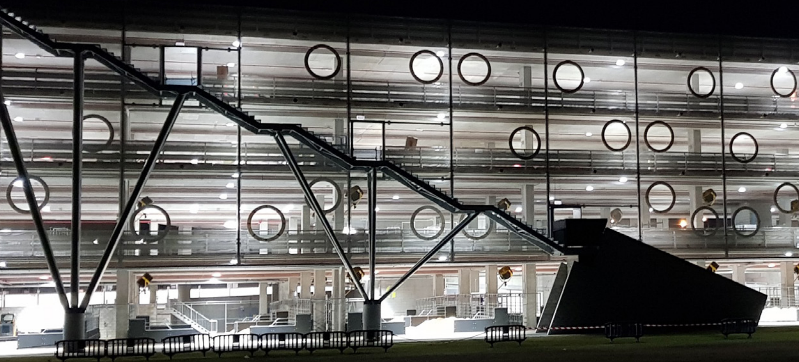
The pavilion at night