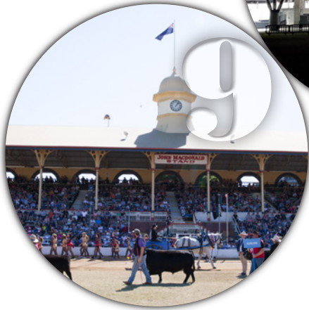
What's New at Ekka