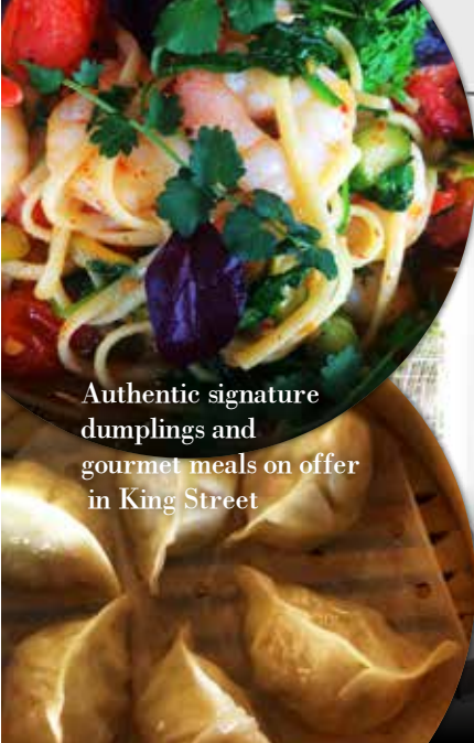
Authentic signature dumplings and gourmet meals on offer in King Street