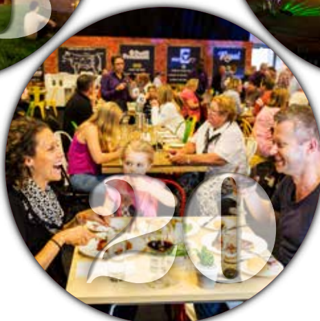
RNA Charity Fundraiser