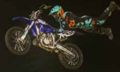
A daring FMX Freestyle King shows off his aerial tricks