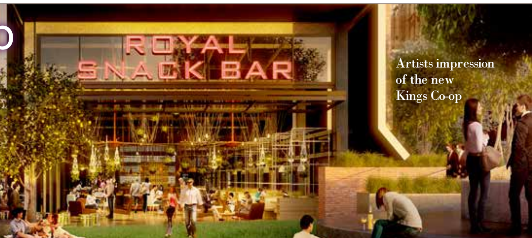
Artists impression of the new Kings Co-op

Work has started on the next stage of the RNA's $2.9 billion Brisbane Showgrounds Regeneration Project.