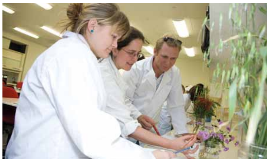
University of Queensland students on their way to a career in horticulture.

It is of concern to me that Gatton College is having trouble attracting suitable numbers of students to fill the various University courses in horticulture that are on offer. This is particularly so