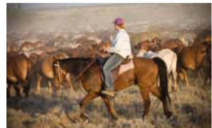
The big drove in action.