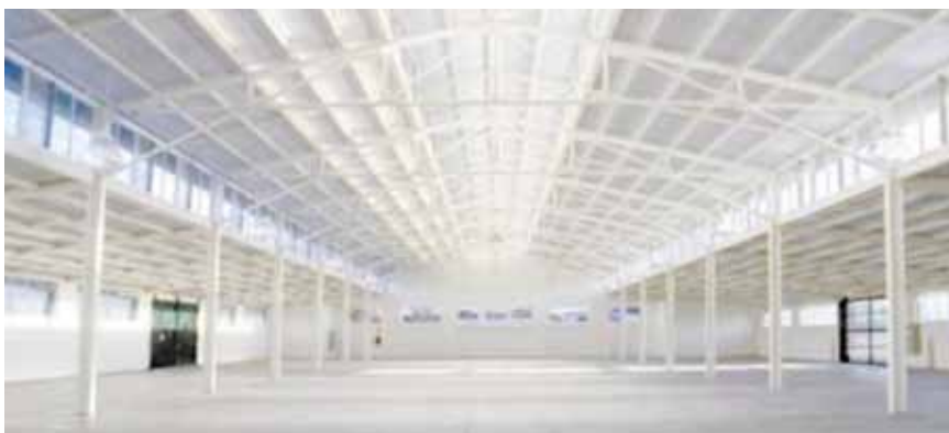
Below: Modernised pavilions now house exhibitors at the Royal Melbourne Show; and below right: The Royal Agricultural Society of Victoria's new contemporary Administration Building.

"Ekka will continue to be an event where the country truly does converge on the city. Only in the future, the two will unite in far superior facilities," he said.