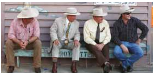
We don't know what these Ekka patrons are looking at, but it's got them excited.