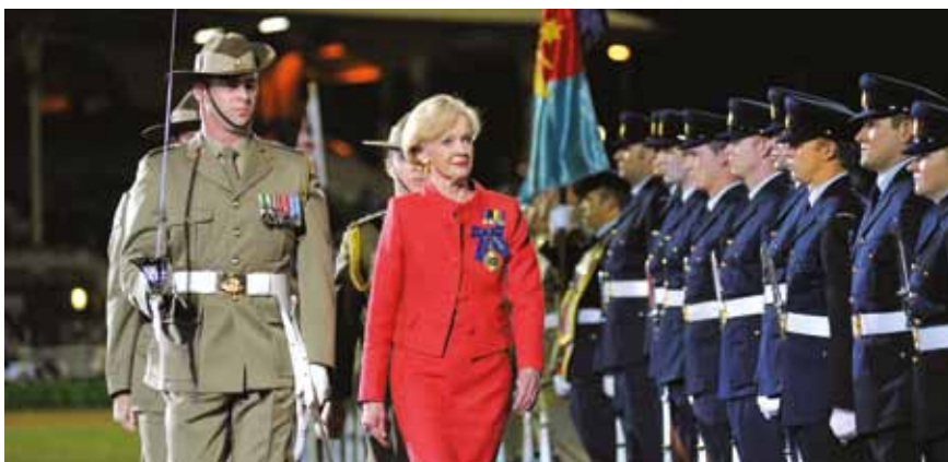
Her Excellency Quentin Bryce AC, Governor General, inspects the front rank at the official opening of the 2009 Royal Queensland Show.