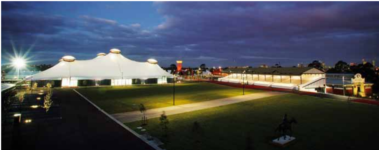
The Melbourne Showgrounds' Town Square