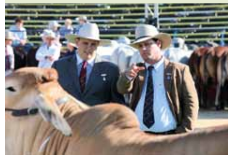
Cattle judges in action

Cow – Gobongo Juliette B43E(P) – Gobongo Cattle Company, Jackson QLD