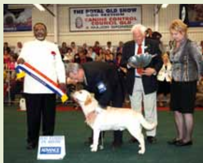
Best in Show 2009