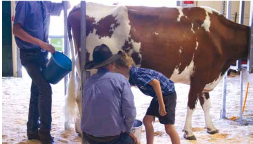
Milking cows at the Rural Discovery Day 2009