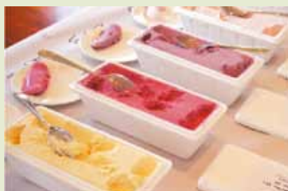
Gelato judging at this year's Show

Champion Cheese – Tasmanian Heritage Signature Blue 1.5kg – National Foods, Burnie TAS