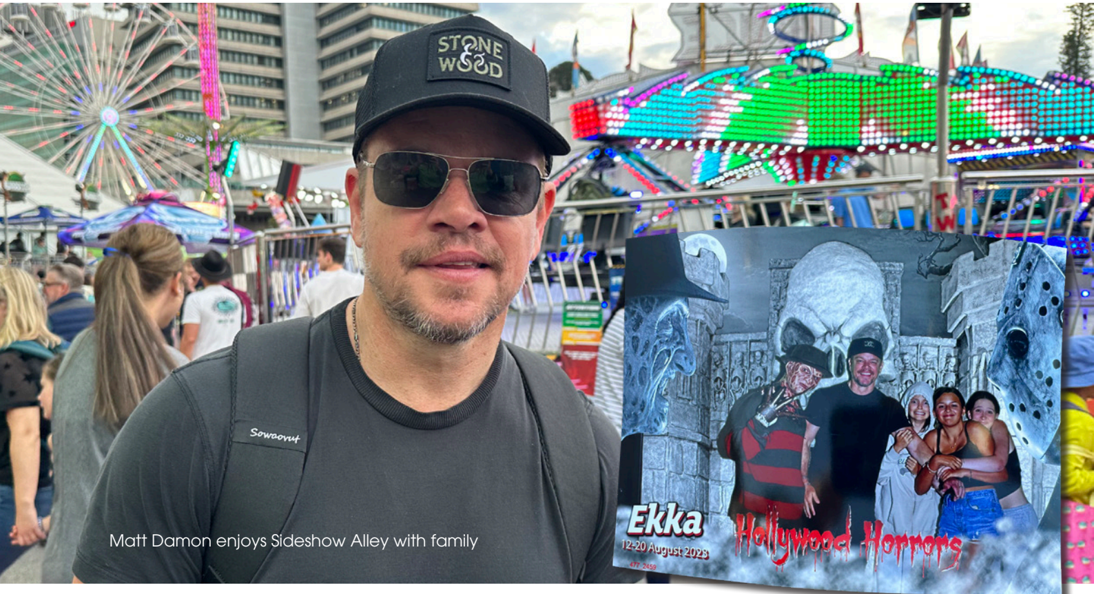
Matt Damon enjoys Sideshow Alley with family