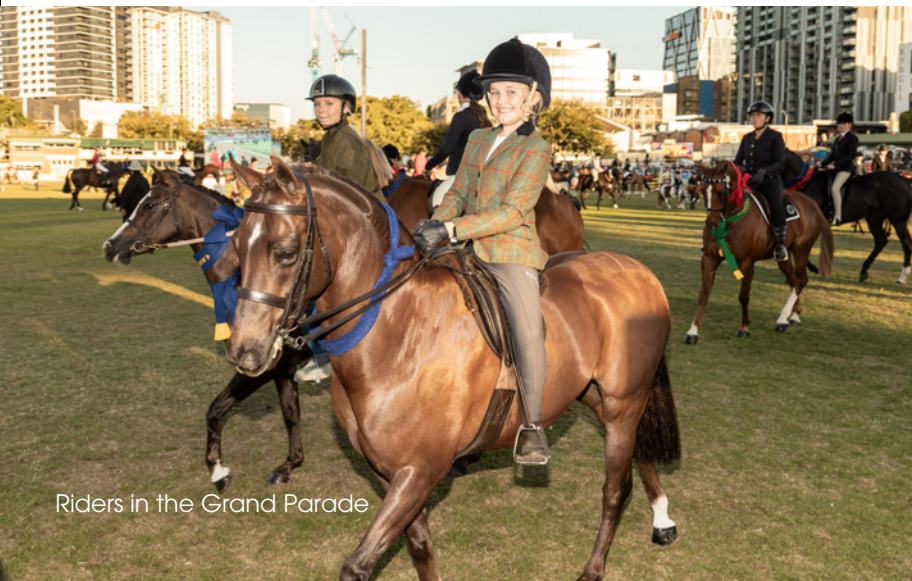
Riders in the Grand Parade