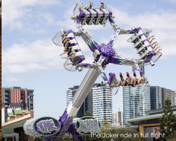
The Joker ride in full flight