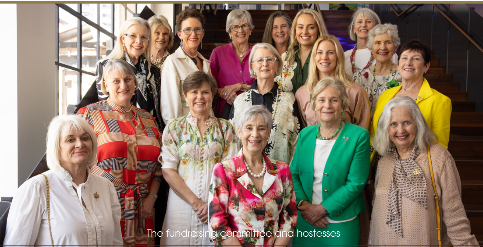
The fundraising committee and hostesses