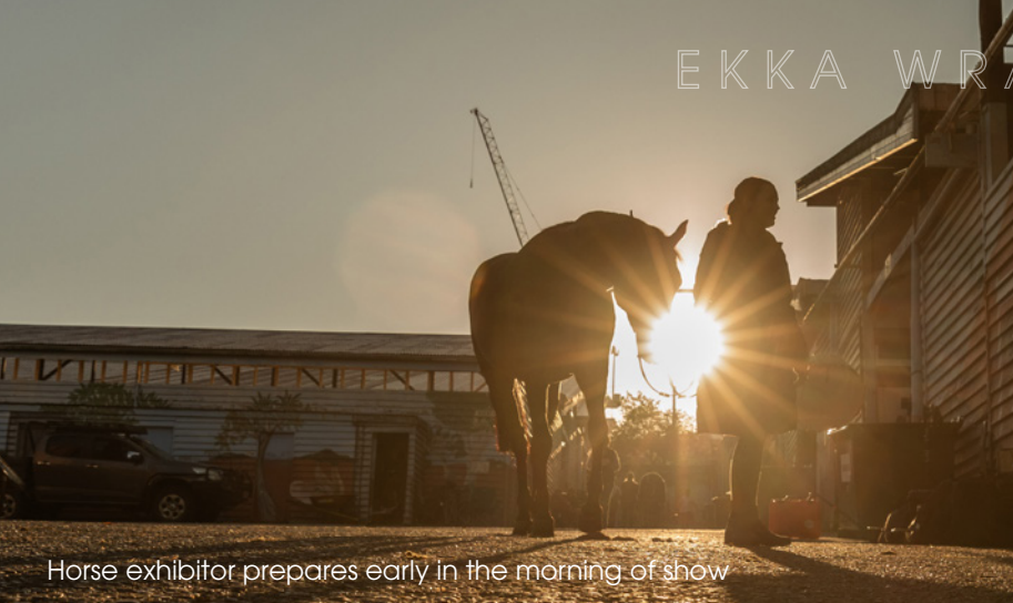
Horse exhibitor prepares early in the morning of show