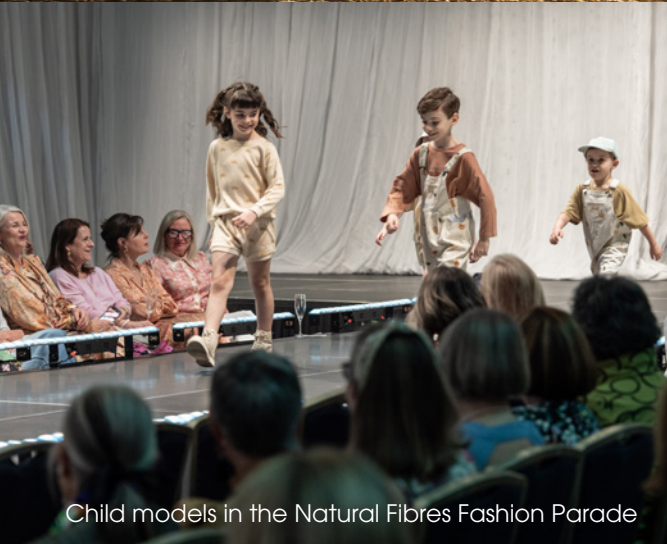
Child models in the Natural Fibres Fashion Parade