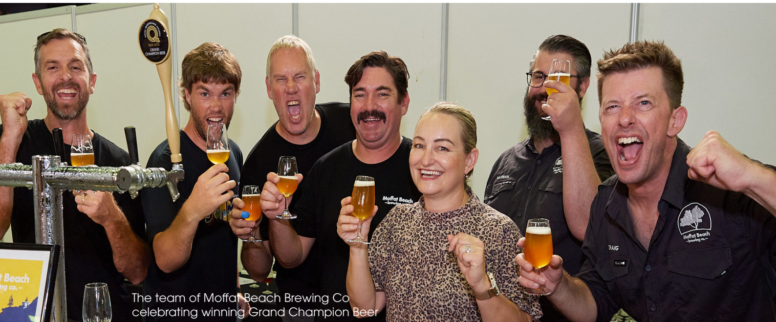
The team of Moffat Beach Brewing Co celebrating winning Grand Champion Beer