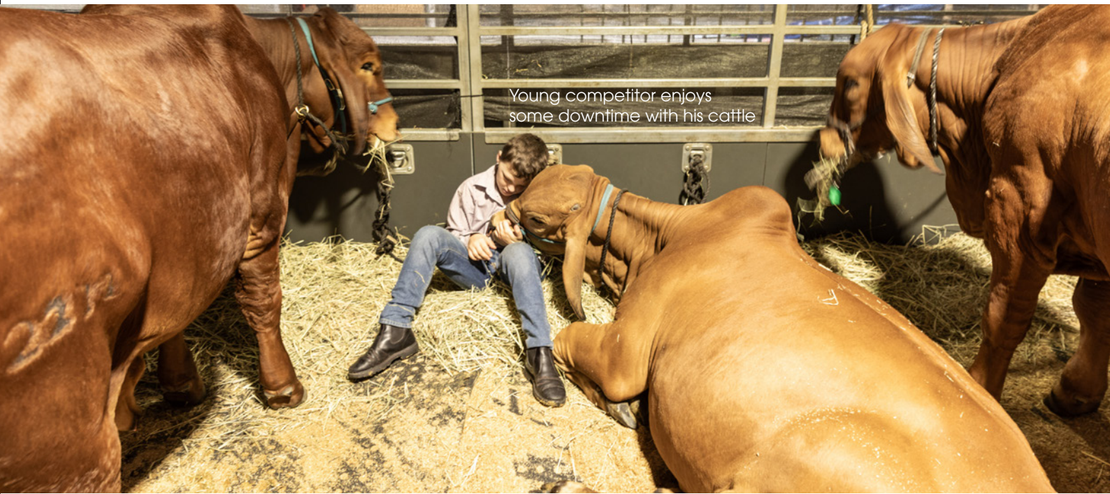
Young competitor enjoys some downtime with his cattle