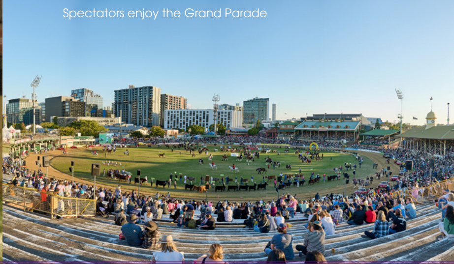
Spectators enjoy the Grand Parade