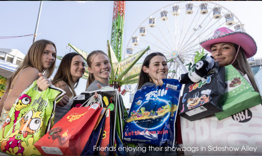
Friends enjoying their showbags in Sideshow Alley