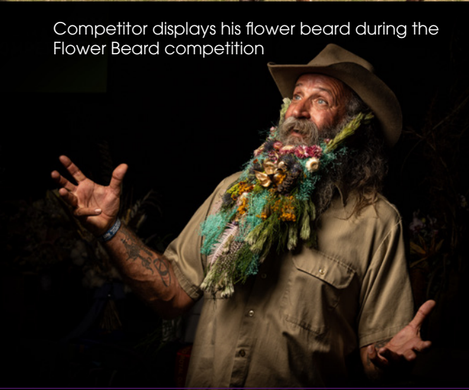
Competitor displays his flower beard during the Flower Beard competition