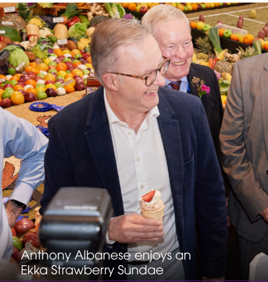
Anthony Albanese enjoys an Ekka Strawberry Sundae