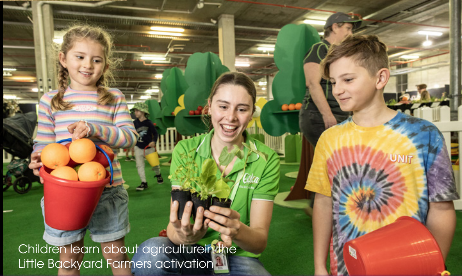
Children learn about agriculture in the Little Backyard Farmers activation