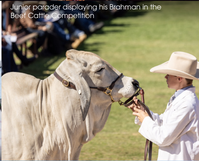
Junior parader displaying his Brahman in the Beef Cattle Competition