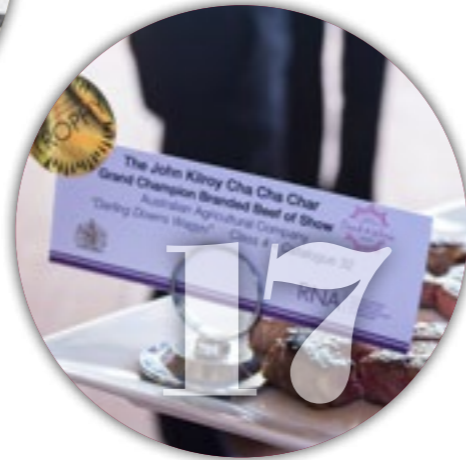
Royal Queensland Food and Wine Show Champions