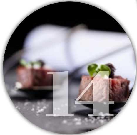
A Foodie's Paradise