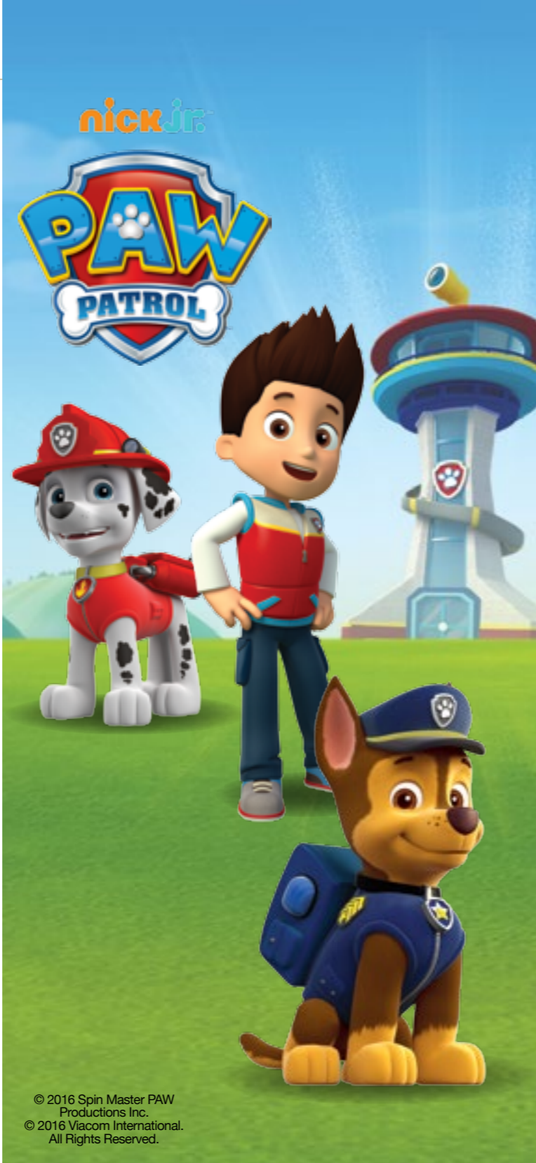
© 2016 Spin Master PAW Productions Inc. © 2016 Viacom International. All Rights Reserved.

Hortiman (aka Matthew Carroll) will conduct activities for the kids each day at 3pm on the Flower and Garden Platform Stage. He has worked in horticulture for more than 15 years and will teach the kids all about gardening, with fun hands-on activities.